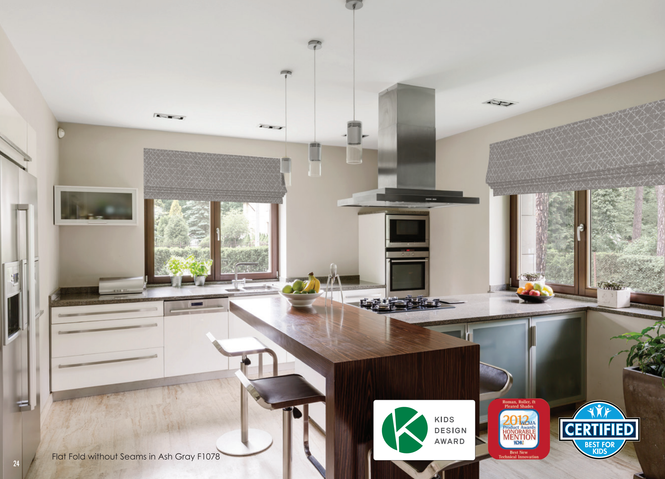
Flat Fold without Seams in Ash Gray F1078