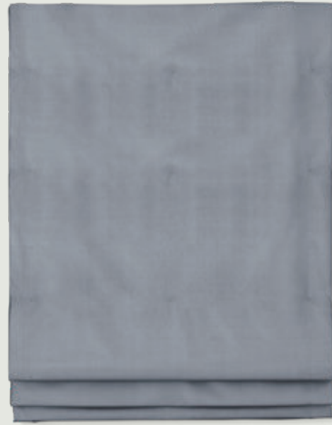
Flat Fold without Seams