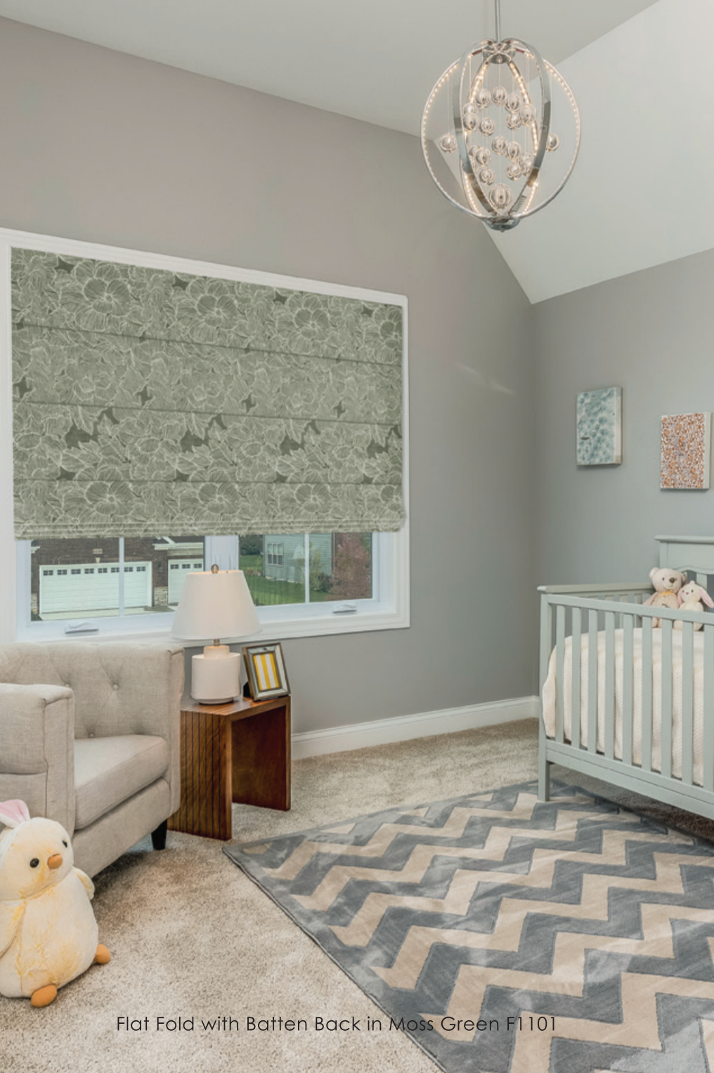
Flat Fold with Batten Back in Moss Green F1101