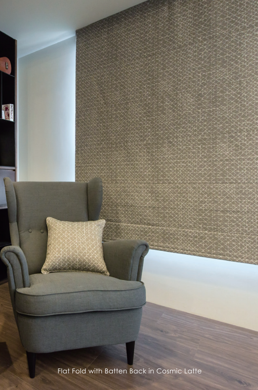
Flat Fold with Batten Back in Cosmic Latte