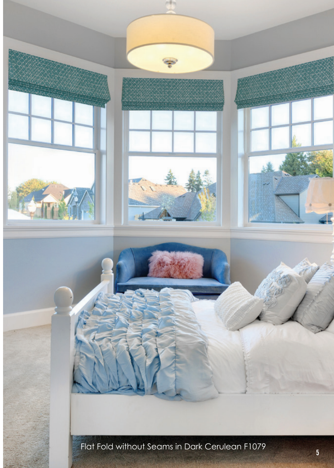
Flat Fold without Seams in Dark Cerulean F1079