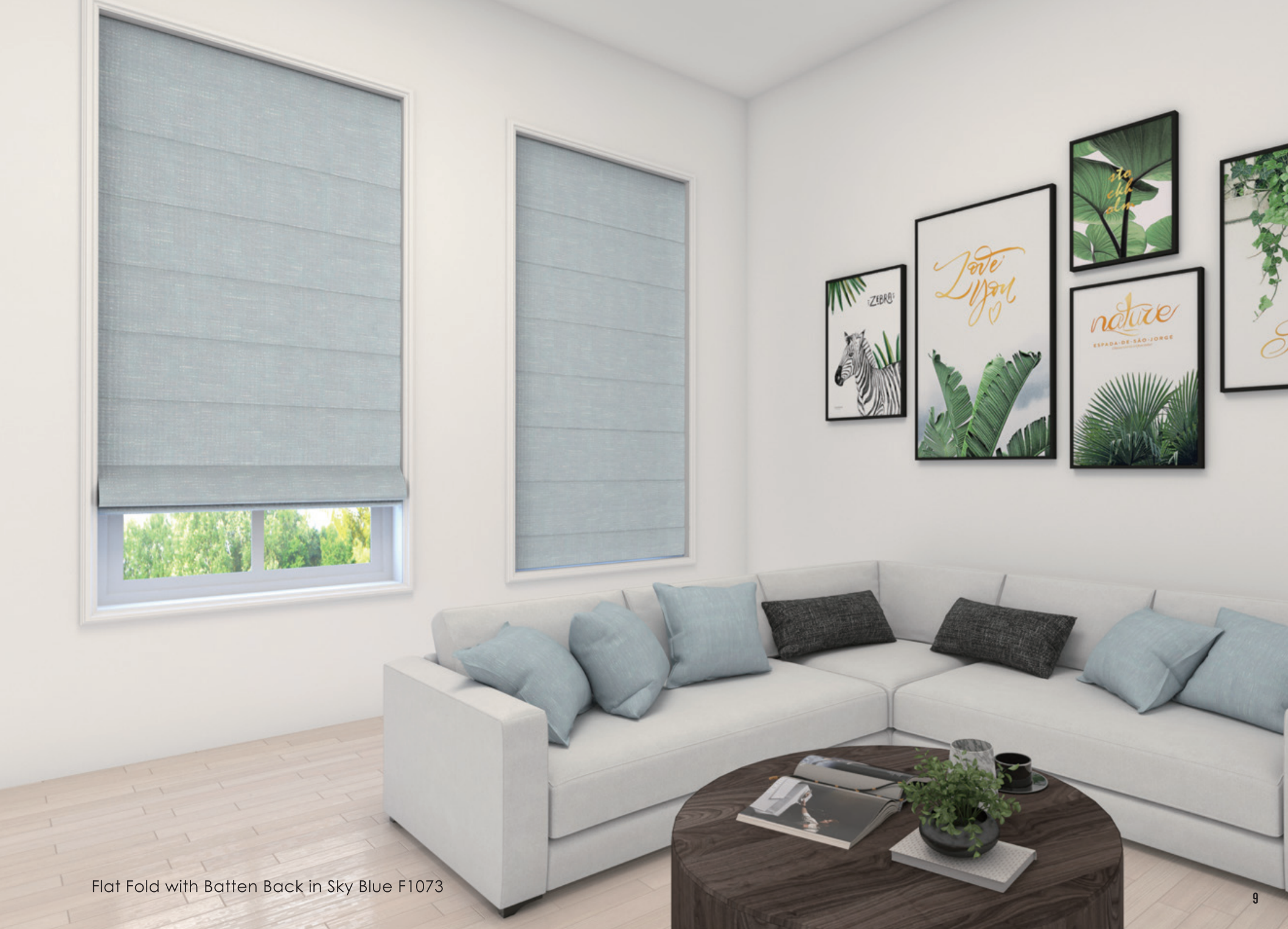
Flat Fold with Batten Back in Sky Blue F1073