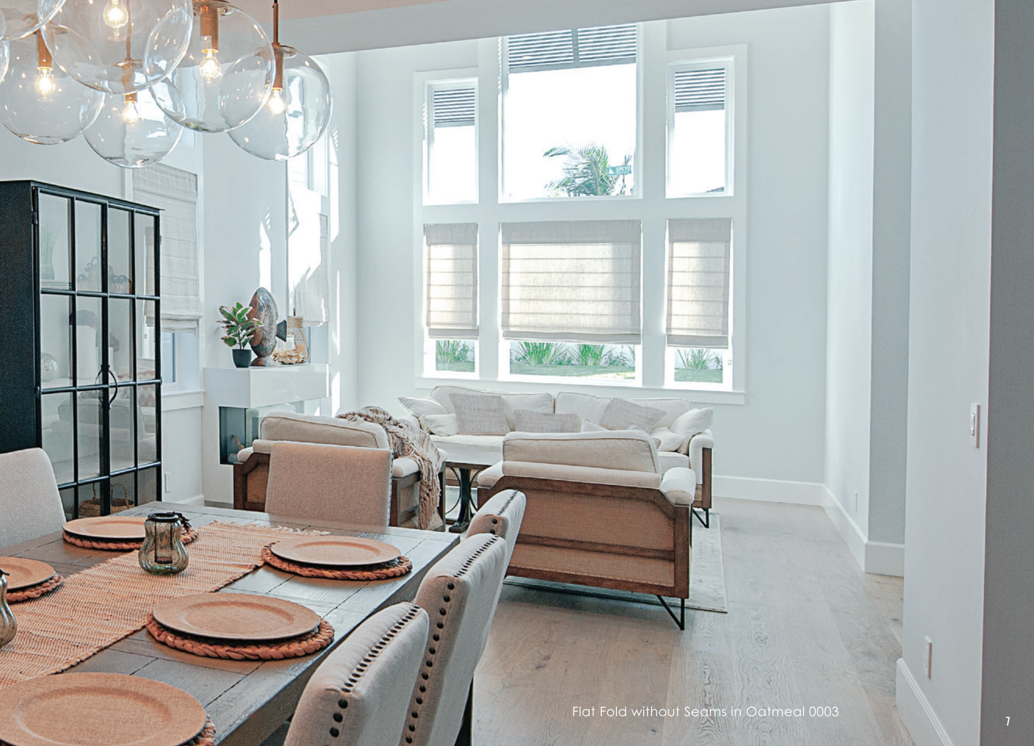
Flat Fold without Seams in Oatmeal 0003