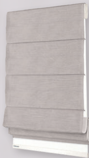
Aerolite™ Cordless Day & Night Shade