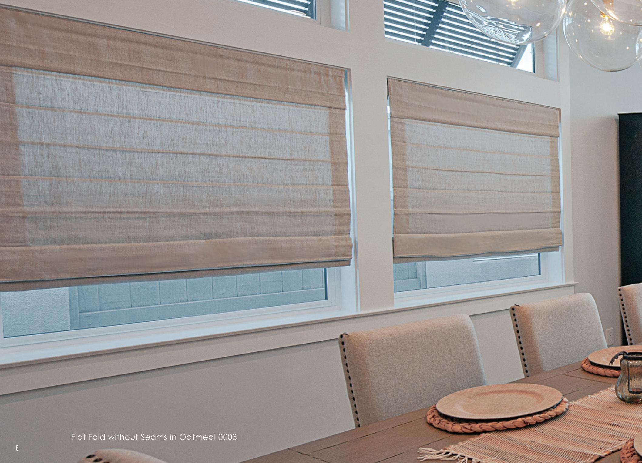
Flat Fold without Seams in Oatmeal 0003