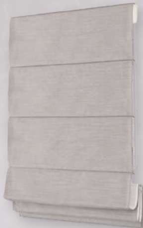
Continuous Cord (Optional SmartRelease™)