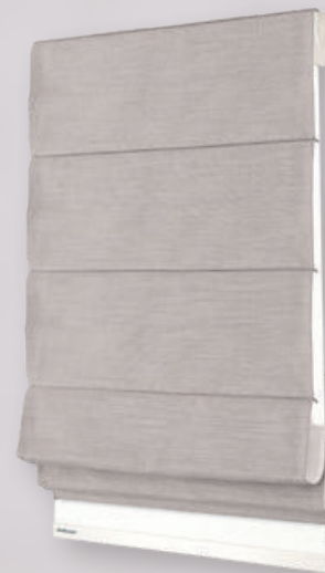
Motorization Day & Night Shade